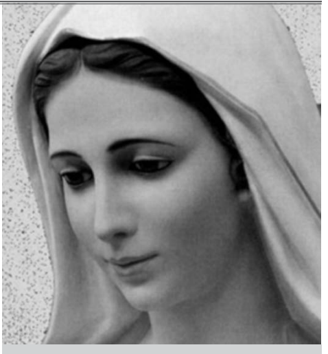
To remain united with You in poverty, to remain united with You in obedience to remain united with You in humility. This will bring many fruits.

To remain united with You in misunderstandings, To remain united with You in persecution, to remain united with You In failure, When we see no fruit this will bring many fruits.