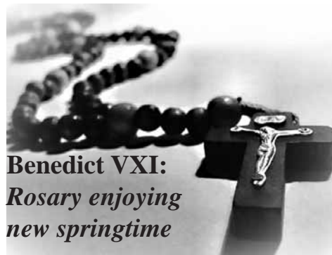
Benedict XVI: Rosary enjoying new springtime

This invocation is consoling for us who live in this atomic age when man’s appetite for power exceeds every limit, and the fear of destruction creeps into hearts. It is assuring that our heavenly Mother should come to remind us that she watches over her children and our families, and that she has come as a messenger of the peace that comes from the heart of the ‘Prince of Peace’, our Lord Jesus Christ. His peace will never end; his peace will grant us the same life of God. It is the peace proclaimed by the choir of Angels the night of Christmas when God - for love of us - was born a baby in the holiest of families.