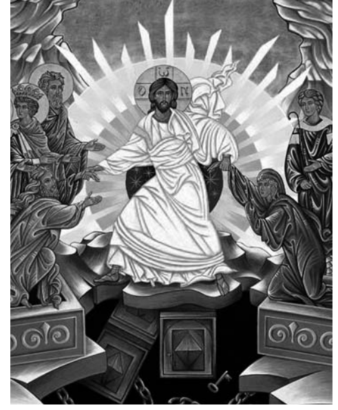
The Lord is enthroned as King for ever! Icon Cenacolo Community Medjugorje

We need to wake from our sleep, from the torpor of death that lurks beneath a showy and apparent efficiency. 'Tis Easter. Let us rise again in Christ! §