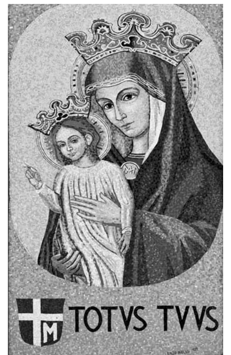
Mater Ecclesiae, St. Peter's Square, Vatican. As desired by JPII after the attack on his life.

Message of the 25<sup>th</sup> of December 2011: