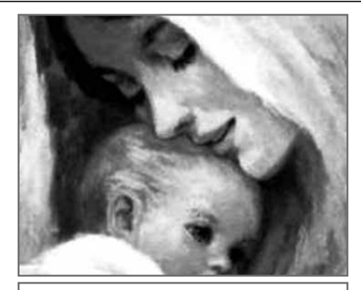
"It is good to await salvation in the hymn of silence, in the quiet certainty that he will come: That poor man who sits waiting, will sit alone and in silence, because the Lord will rise up over him".

Rest your body and spirit, may they be in God's love. We know well how necessary rest is for our physical lives, but what is infinitely more important for man's soul and body together, is to rest in God's Love. It is when Adam is asleep that God creates man, man and woman, in His image and likeness (cfr. Gen 2,21-22; 1,27). It is the dawn of the first day after the Saturday (the sacred day of rest) that brings the annunciation of the Resurrection of Our Lord Jesus Christ. Great events are born in silence, they are ignored or marginally welcomed by our media, but they are delivered and handed over to the mouths of children and infants, to the testimony of those whom the world believes to be insignificant. Things could not be otherwise, because nothing of that which exists in the world can contain God if not man's heart, as long as it is an open heart - that is, not folded back on itself - a pure heart - that is, free from all forms of power, from bias interest, from all compromise and bargaining - a humble heart - that is, that does not admire and adore itself - a simple heart - that is, that knows how to seek God where He awaits it – a heart,