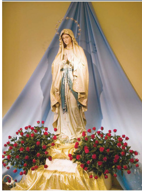
8th December: Immaculate Conception of the B.V. Mary