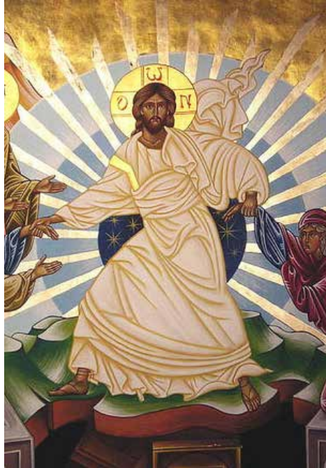
Message to Mirjana, 2 February 2014:

The old temptation of being masters of our own fate still governs the human heart, making us unable to see how Creation it-